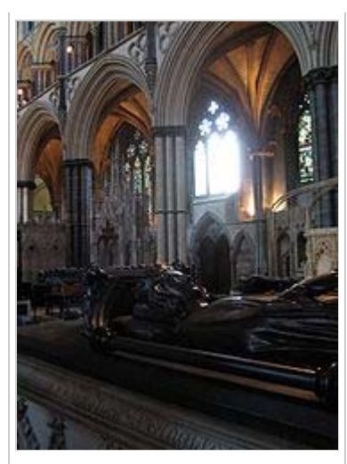
The tomb of her viscera at Lincoln Cathedral.

In the thirteenth century, embalming involved evisceration. Eleanor's viscera were buried in Lincoln Cathedral, where Edward placed a duplicate of the Westminster tomb. The Lincoln tomb's original stone chest survives; its effigy was destroyed in the 17th century and replaced with a 19th-century copy. On the outside of Lincoln Cathedral are two statues often identified as Edward and Eleanor, but these images were heavily restored and given new heads in the 19th century; probably they were not originally intended to depict the couple.[1]