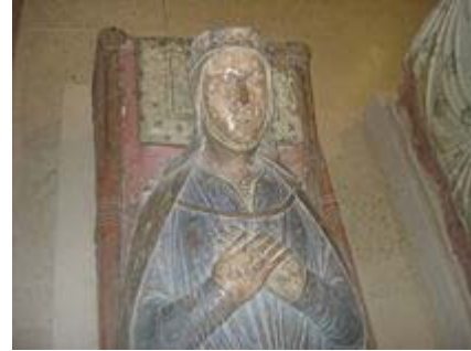
Queen consort of England

Queen consort of England Countess of Angoulême